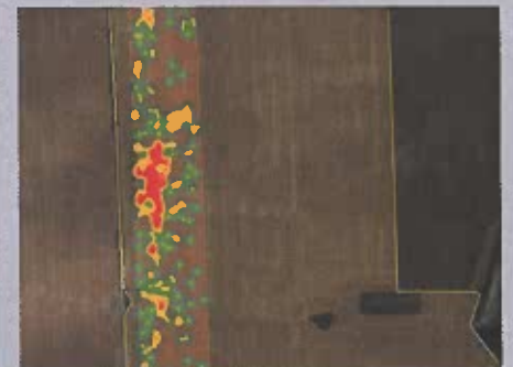
Weed density data from the tramline plots (left) indicated the overall efficacy of the pre-em herbicide, but it was the detail from the weed heat maps (right) that offered more insight.