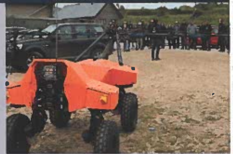
Farmers at a recent meeting in Hampshire hear about what robot Tom spotted in wheat fields this season.

Another survey on a different farm showed up an area of slug damage, for instance, giving the patterns of how this developed. The weed survey