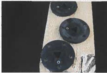
The metering disc (left) is 3D-printed and can be made to order. Seed drops down to the shoe (right) where a gate opens to let it into the soil at precisely the right moment.

The seeding unit comprises a six-litre hopper, metering unit and double-disc coulters, designed to plant to up to 6cm depth into a fine tilth, with a usual working depth in most soil types of around 3cm. the